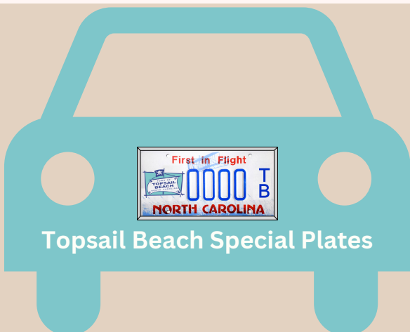
Topsail Beach Special Plates

Check out Pender County's trails at https://www.visitpender.com/what-to-do/category/trails